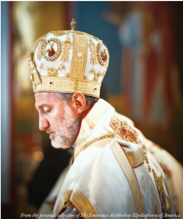
From the personal collection of His Eminence Archbishop Elpidophoros of America